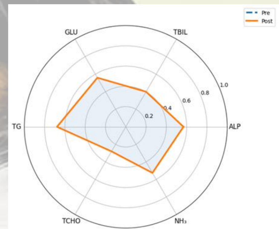
Figure 1. Radar plot illustrating the overall improvement of key biochemical markers in dogs following Reishi supplementation.

The present study demonstrated that dietary supplementation with Ganoderma lucidum improved metabolic profile, hepatic biomarkers, and digestive efficiency in dogs presenting metabolic imbalance. Reishi supplementation contributed to better lipid and glucose regulation, reduced fecal output, and enhanced protein digestibility, supporting its potential as a functional nutraceutical in canine nutrition and metabolic health management.